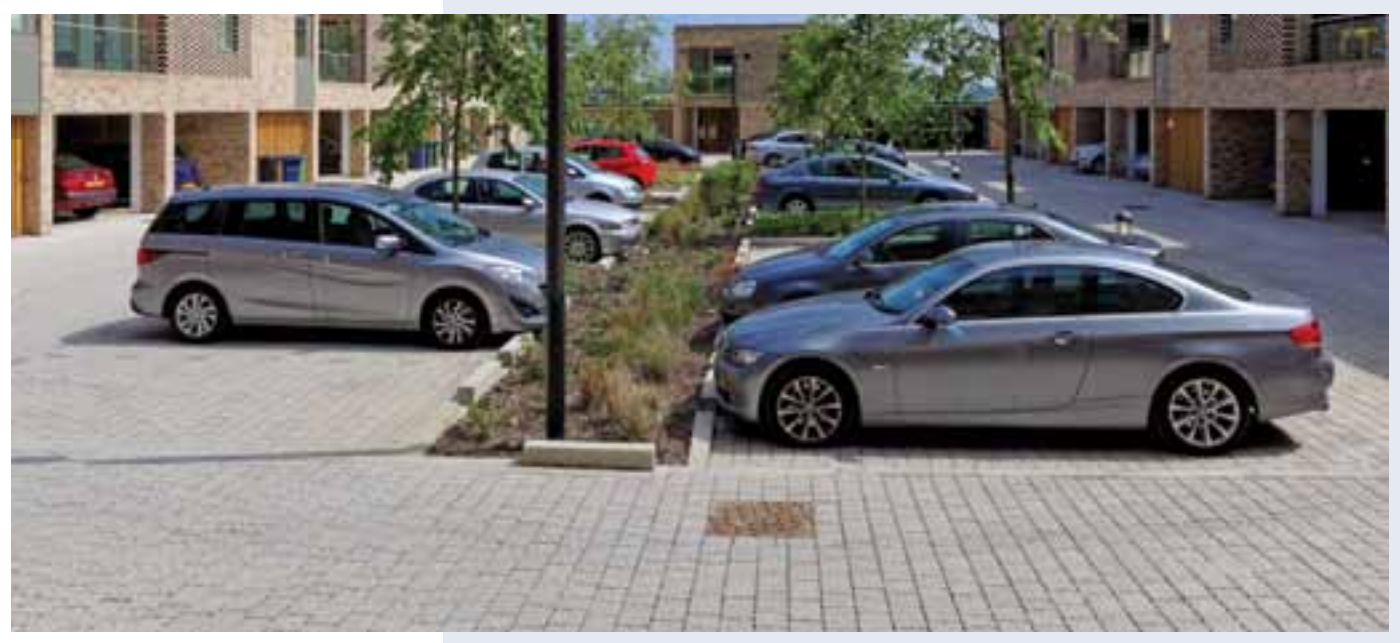
Permeable and conventional concrete block paving at the award winning 'Abode' housing, Cambridge.

Today, few would disagree with the principle that SuDS and techniques such as concrete block permeable paving are needed to help fight flooding and pollution – particularly with overloaded sewers, urbanisation and climate change. Now, there is also a growing realisation that SuDS can deliver far more, acknowledged by Government's latest move to implement them through the planning system.