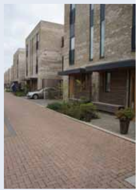
Permeable paving at Seven Acres (Skanska), Cambridge

Government requirements for SuDS on developments in England came into force in April 2015 and are being implemented through the planning system. A ministerial statement now sits alongside the National Planning Policy Framework (NPPF) as additional policy, spelling out: "the Government's expectation ... that sustainable drainage systems will be provided in new