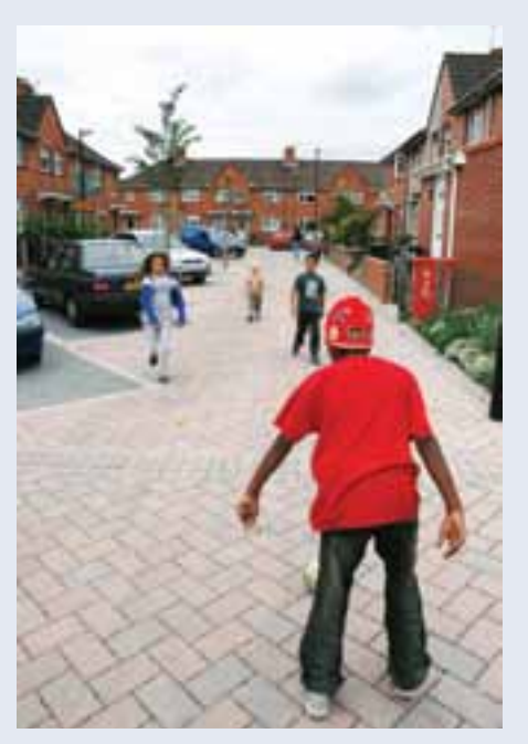
Retrofit concrete block permeable paving in Bristol.