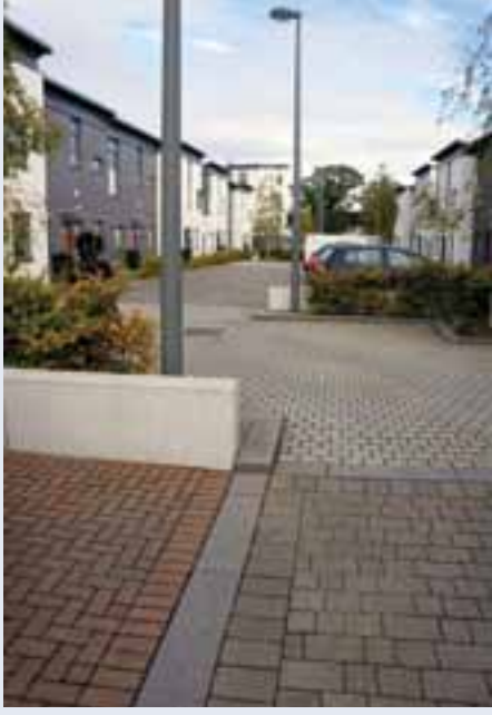
Permeable and conventional concrete block paving characterise these innovative, urban shared-spaces in Craigmillar, Edinburgh. Interpave case study available.