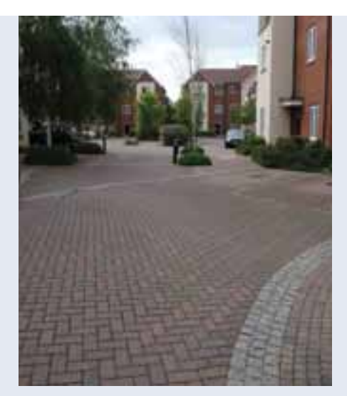
Concrete block permeable paving characterises this high-density town-centre housing project in Abingdon, Oxfordshire (above).

There is therefore no need for highway authorities or other bodies to refuse adoption of correctly designed and constructed concrete block permeable paving. The latest report from the Committee on Climate Change<sup>2</sup> stresses the importance of addressing this issue.