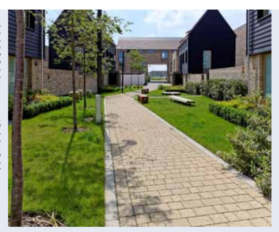
Pedestrian 'green lanes' in concrete block permeable paving traverse 'Abode', Cambridge.

"Guidance was produced on the design and adoption of SuDS, which focused on a landscape-led design approach. The local plan is in the process of being reviewed and updated, and the principles of SuDS are woven into policy proposals with a focus on achieving high quality environments with high quality SuDS. Permeable surfaces are encouraged on all external areas and are seen as an essential component in the delivery of the entire SuDS management train."