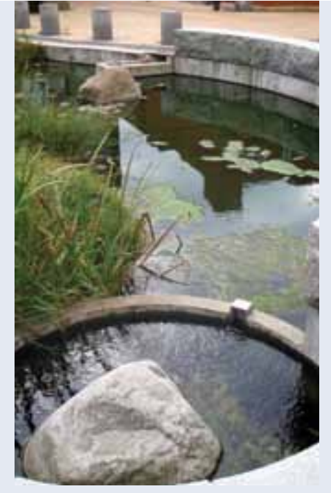
These examples from Malmö in Sweden give a feel for the qualities that well-designed SuDS - with water conveyed and stored on the surface can add to hard-landscaped urban areas.