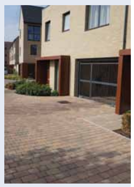
Permeable paving at Novo (Glebe Farm), Cambridge

"Local planning authorities should now prioritise sustainable drainage as a key element in development control."