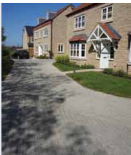
Bicester in Oxfordshire, is home to major new developments making extensive use of permeable, in conjunction with conventional, concrete block paving. Under construction now are Kingsmere (above) and the North West Bicester Eco-town.