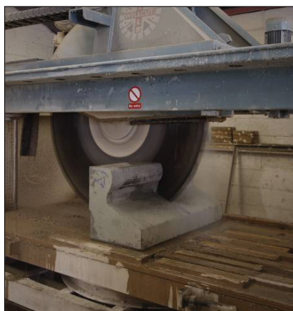
Saw cutting and drilling under factory controlled conditions