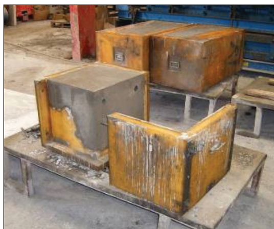
Moulding off site